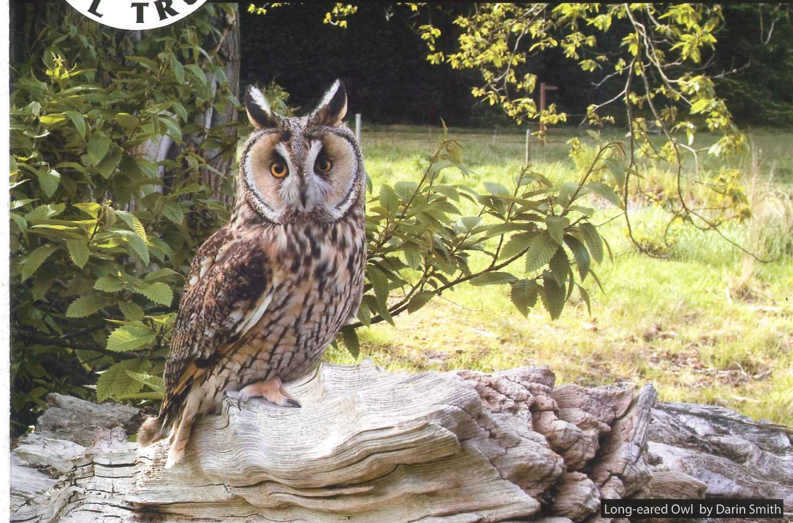
Long-eared Owl